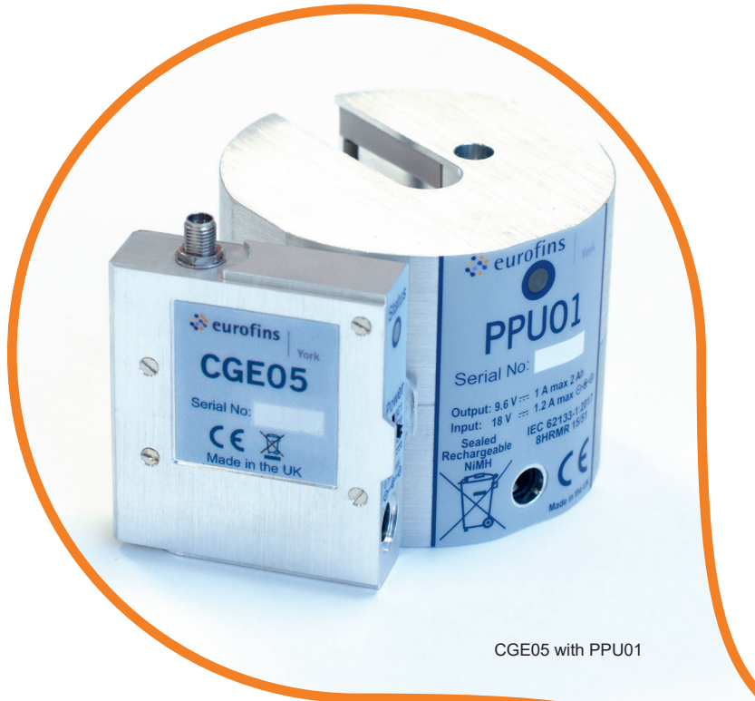
CGE05 with PPU01

The CGE05 is equipped with a precision SMA output connector to which an antenna can be fitted for generating radiating E-fields.