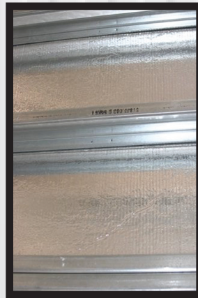
4'x8' Steel Modules 1" x 4" x 1/2" TP Welded to Frame 7/16 OSB on top