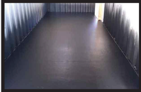
1/4" Steel Floor Welded to Frame Indoor/Outdoor Carpet