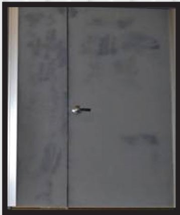
Flush Steel Doors Unless RF Welded Doors