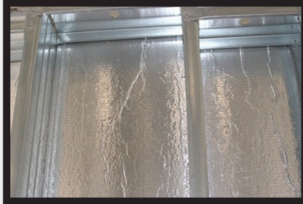
4'x8' Steel Modules 1" x 4" x 1/2" TP Welded to Frame 7/16 OSB on top