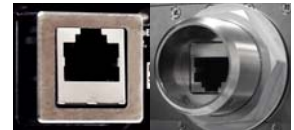
Solid milled RJ45 port protection!

High efficiency RF isolated I/O interfaces are nothing new to Ramsey Electronics. While intended for use with our RF Shielded Test Enclosures, we realize that you may also need such an effective isolated interface on your other existing equipment. Whether it be a screen room or a third party farady cage, we made the installation of our STE10GBE simple for all. Like our USB, Gigabit, and HDMI interfaces, we designed the interface inside a solid finely milled block of aluminum. Then to protect the RJ45 connectors on both sides, we milled solid aluminum protective surrounds around them to protect against broken connectors caused by over-tensioned cables and continuous duty OEM production environments. Finally, like our other interfaces created a single hole through wall mount to provide a simple yet 100% bond to your mounting surface. A custom flange nut and EMI RF gasket is provided to assure absolute RF radiated isolation.