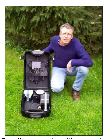
Smaller case (positioner only)