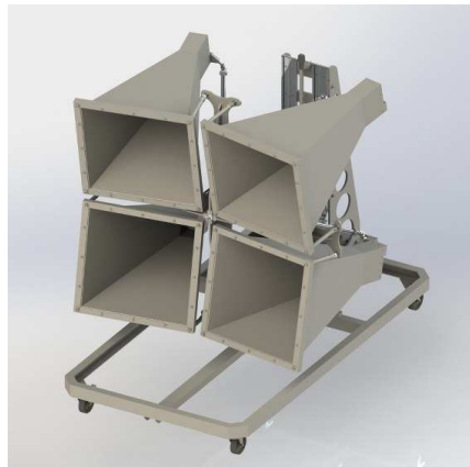
Typical photograph with mounting trolley. Finish according to customer specifications.

Contents Summary Gain / Antenna Factor at One Metre Beamwidth at One Metre VSWR