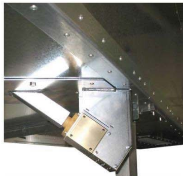
MGT750 outside the GTEM 750