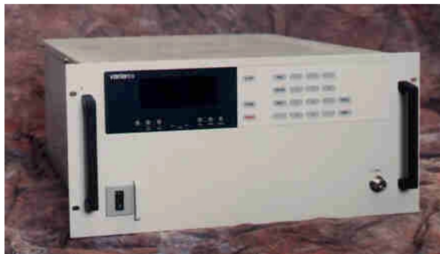
Figure 1. L-Band J Series CMPA

Today, CPI Satcom Division has provided thousands of broadband power amplifiers and integrated satellite uplink power amplifiers in the L, S, C, X, Ku, DBS and Ka- band frequency ranges to worldwide users and has become the leading supplier of this class of products.