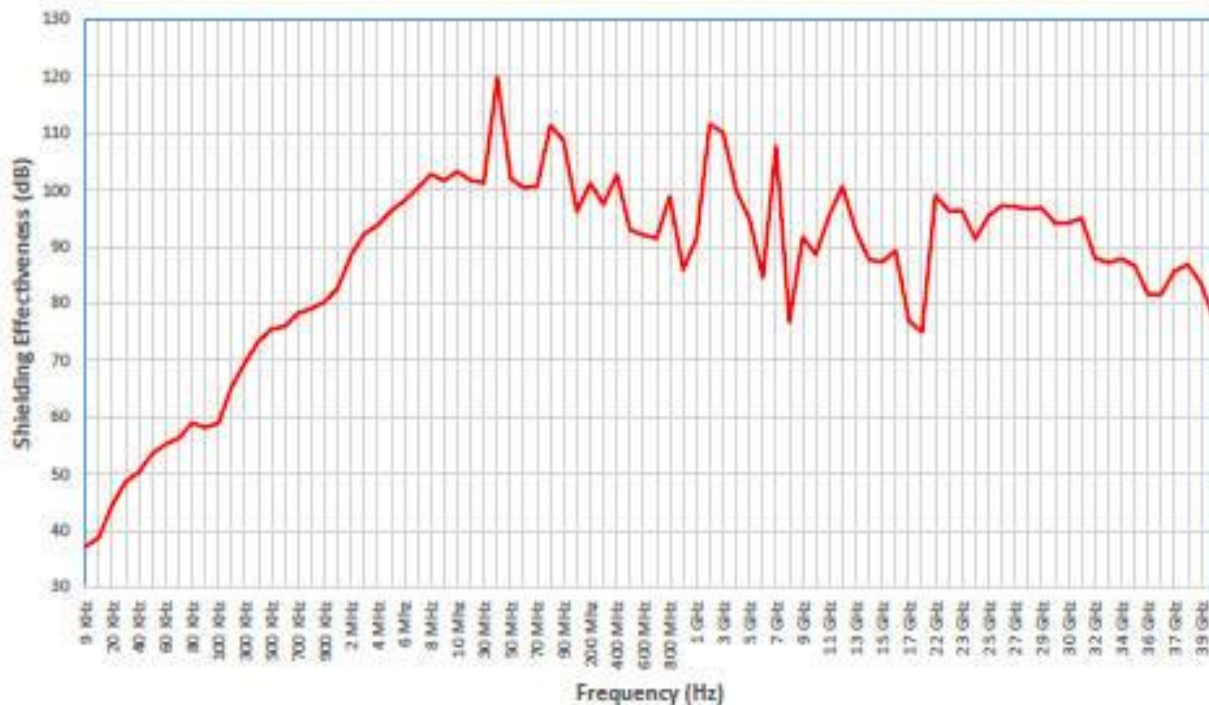
CU50 Shielding Effectiveness (Butt Joint Seam Taped) Tested per IEEE-299 : 2006

— 110-ANN .005" copper with .005" x 4.00" EC copper tape