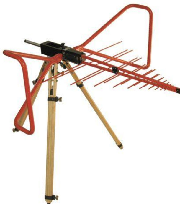
J-100-2 Tripod shown with JB6 Antenna and TRAM-1 Mount