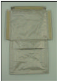
Step 1: Open pouch.

Caution: Follow these directions exactly to secure evidence