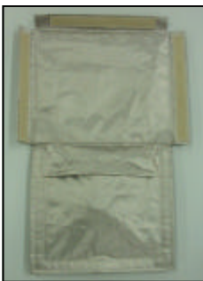
Step 3: Completely close half inside pocket on the inside.