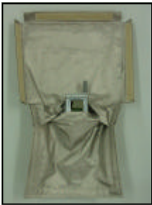
Step 2: Open inside flap and insert electronic device into pocket.