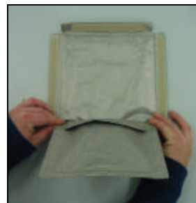
Step 4: Fold pouch in pocket with