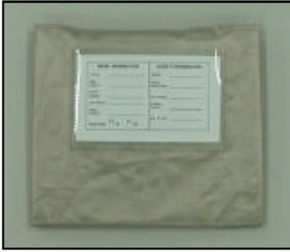
Completed pouch with information card.

Caution: Follow these directions exactly to secure evidence