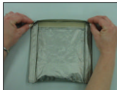
and Step 6: Fold over top flap and secure with hook-and-loop strips.