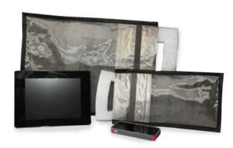
Part# SFP610 and SFP1113