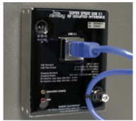
Solid milled Strain Relief!

To protect the integral USB3 connectors from lateral stress damage we added integral solid milled tension surrounds on both the internal "A" and external "B" connectors. In addition, the outside of the unit includes a solid milled strain relief post to clamp or cable-tie your test cable to protect the USB3 "B" connector from accidental cable over-tensions. This puts an end to broken I/O ports and connectors! We even include TWO double shielded USB3 A/B cables for your test applications!