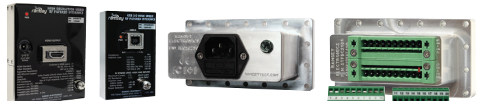
HDMI 4K Video USB2.0 High Speed CE Global Power Interface Universal 20-Line Power & Control