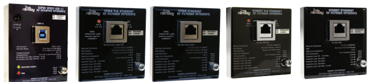
USB3.1 SuperSpeed 10GbE PoE Ethernet 10GbE 8-Line Data & Ethernet Gigabit PoE Ethernet Gigabit 8-Line Data & Ethernet

Note: Specifications are average achieved and certified final test measurement values. Subject to change and revisions. Not responsible for typographical errors and omissions.