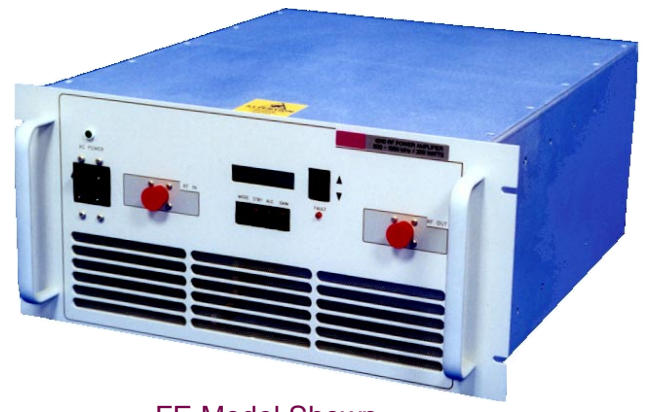
FE Model Shown