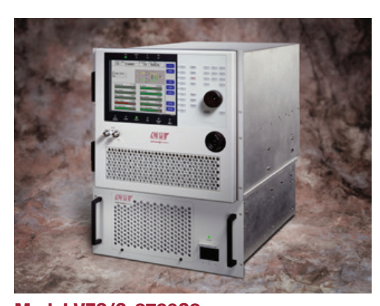
Model VZS/C-2780C2 2.0 to 8.0 GHz, 500 watt S/C-band rack-mount TWTA for test and measurement applications

Backed by over two decades of satellite communications experience, and CPI's world wide 24-hour customer support network that includes more than twenty regional factory service centers.