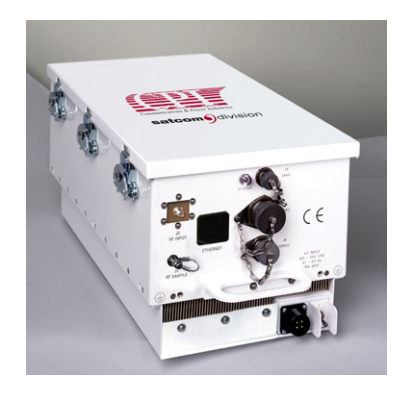
Model TE01KO-C 50 watt K-band TWTA for EMC/EMI Test Applications

Backed by over 35 years of satellite communications experience, and CPI's worldwide 24-hour customer support network that includes more than 20 regional factory service centers.