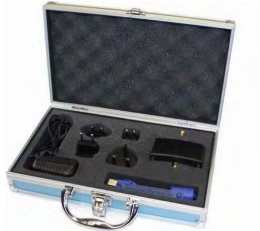
Scope of delivery: transport case, international 12V power supply, USB Cable, SMA/SMA (f/f) Adapter, SMA Tool, PC Software, Calibration data

With the very compact dimensions of just 80x50x30 mm and weighing only 150 grams, the BPSG series is predestined for mobile use and fits in every pocket. The compact form factor makes the BPSG the world's smallest battery-powered RF generator up to 6GHz.