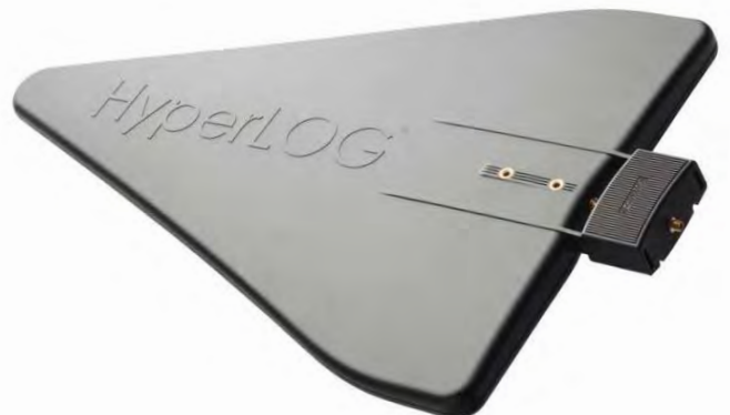
The BPSG as Field-Strength-Generator up to 3V/m (1m distance), available as „DFG 4060“

The BPSG can also be connected to an external reference clock and thus be synchronized with a measuring system. In addition, this way even higher accuracy can be achieved (Using an OCXO, Rubidium timebase etc.).