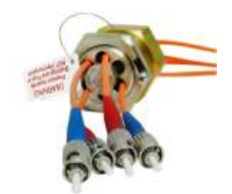
WGF-6 Shown with ST fiber installed