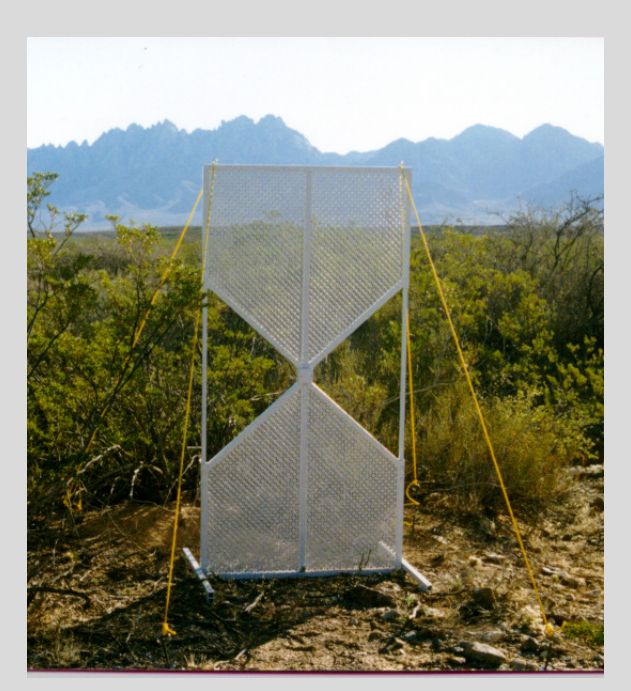
BM-04 Communications Antenna

The BM-04 is a very wide band, electrically small biconical monopole antenna designed to allow coverage of the VHF/FM communications band (30-88 MHz) without need of tuning systems. The very wide bandwidth will also transmit fast rise pulses with high fidelity for HPM operations. This rugged antenna is portable and easily shipped/stored and can be set up and operational in a matter of minutes. Guy kit included for outdoor operation in high winds.