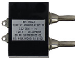
Solar Type 2902-1 Current Sensing Resistor 0.02 \Omega \pm 1%, 1 V = 50 A