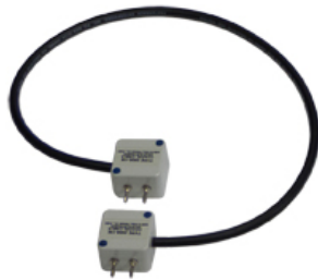
banana plug connectors