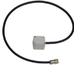
Solar Type 2806-1BN coaxial cable with banana plug and N connector