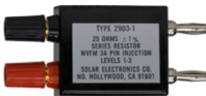
Solar Type 2903-1 25 \Omega \pm 1% Series Resistor WVFM 3A pin injection levels 1-3