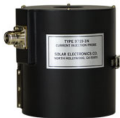
Solar Type 9719-1N Current Injection Probe