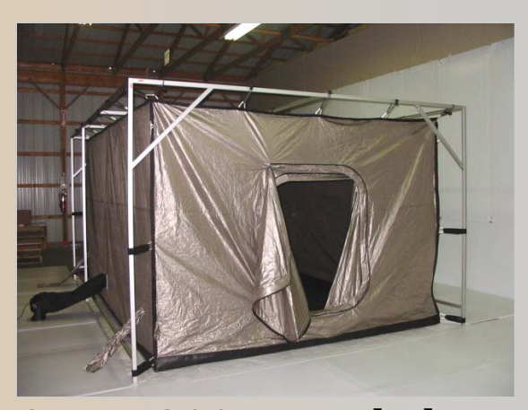
Series 300 Extruded Aluminium Frame