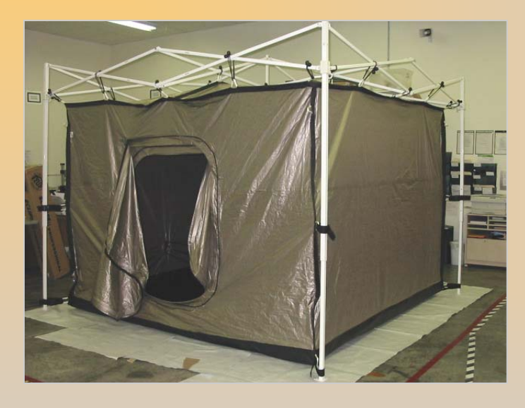
Series 100 EZup Aluminium Frame