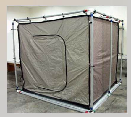
Series 200 PVC Frame