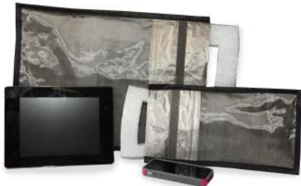
Part# SFP610 and SFP1113