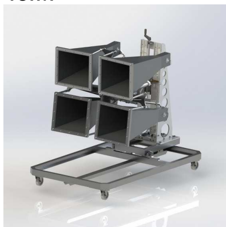
Typical photograph with mounting trolley. Finish according to customer specifications.

Contents Summary Gain / Antenna Factor at One Metre Beamwidth at One Metre VSWR