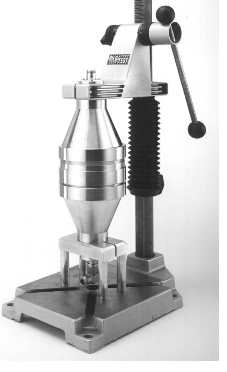
The TEM – Measuring Cell TEM -2000 permits the measurement of the screening attenuation of electrical conducting plastics, conducting laminated plastics, screening materials and braids.

The special construction of the TEM - 2000 combine the advantages of TEM – measuring cells with a permanent and kicked inner conductor.