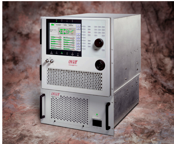
CPI 500 W M-band TWT, Model VZM2780C2

Backed by over 40 years of satellite communications experience, and CPI's worldwide 24-hour customer support network that includes more than 20 regional factory service centers.